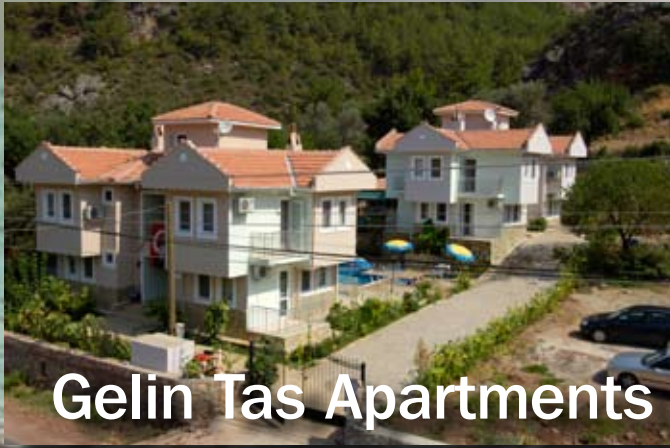
Gelin Tas Apartments