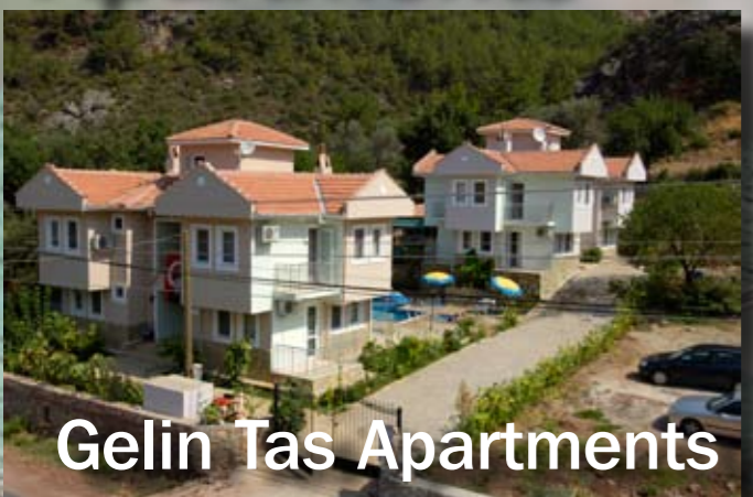
Gelin Tas Apartments